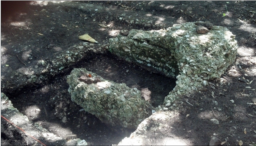
Figure 3. Structure II facing west.

dense layer of crushed, burned shell and lime was found in a test unit immediately outside the east wall. Manufacturing tabby includes burning shell and processing that to produce lime. Structure II is likely a lime slaking pit used during BB Sams' expansion, and was never intended as part of the completed project.