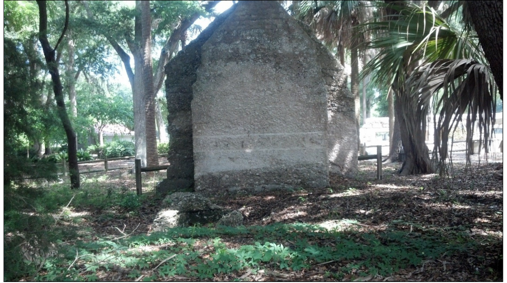
Figure 2. View north to back of chimney with uncleared walls of Structure II visible.

In May of this year TRC had the opportunity to work at the Sams Plantation Complex Tabby Ruins on Dataw Island near Beaufort. The complex contains ruins of the main house, kitchen, slave quarters, out buildings, and a chapel with cemetery. Construction of the complex began in the eighteenth century, but the site as we see it today is the result of an early nineteenth century expansion during the ownership of Berners Barnwell (BB) Sams. Tabby was a popular building material in the Beaufort area during the colonial and antebellum periods. It could be manufactured on-site, it used locally available materials (shell, lime made from shell, water, sand), and it resembled far more expensive stone buildings. BB Sams made extensive use of tabby and included a garden wall enclosure surrounding the main house complex that also served as the exterior wall for the kitchen and cabins (Figure 1).