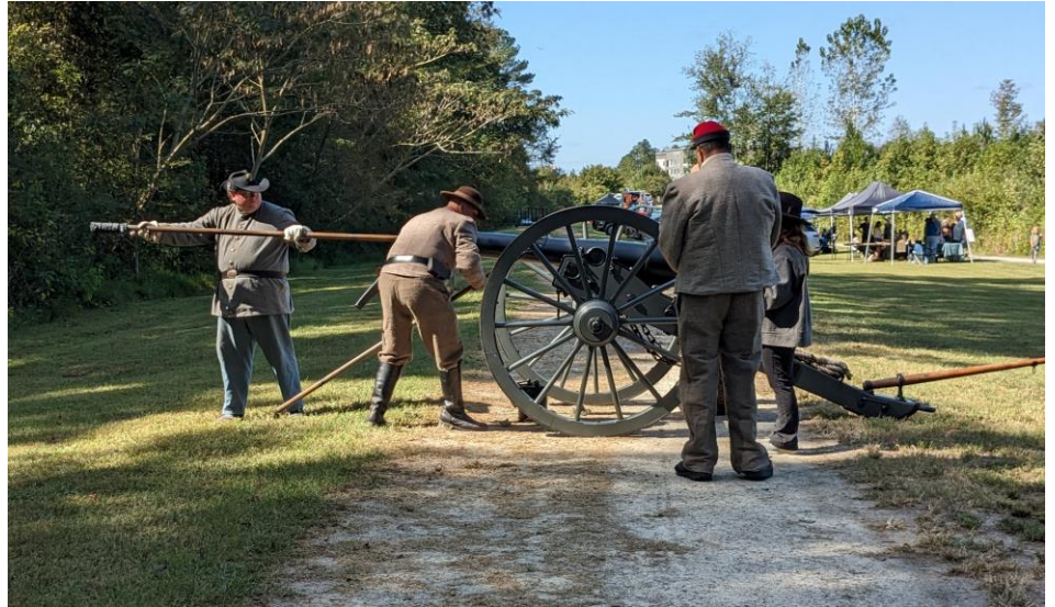
Cannon firing demonstration by historical reenactors at ASSC Fall Field Day 2023.

The Archaeological Society of South Carolina Quarterly Newsletter